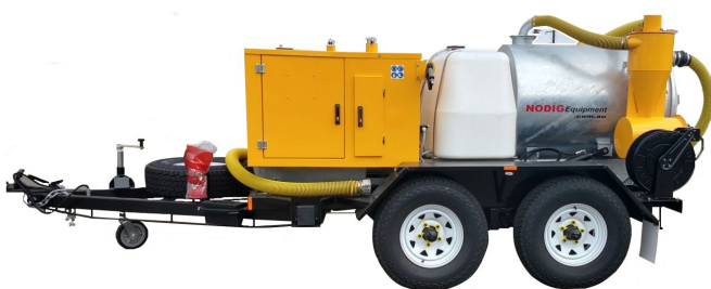
VM850 Diesel Trailer Mounted