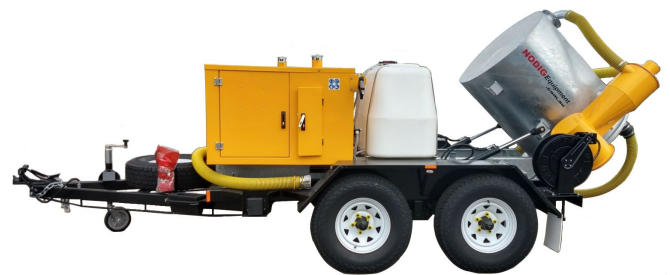
VM850 Diesel Hydraulic Tipping